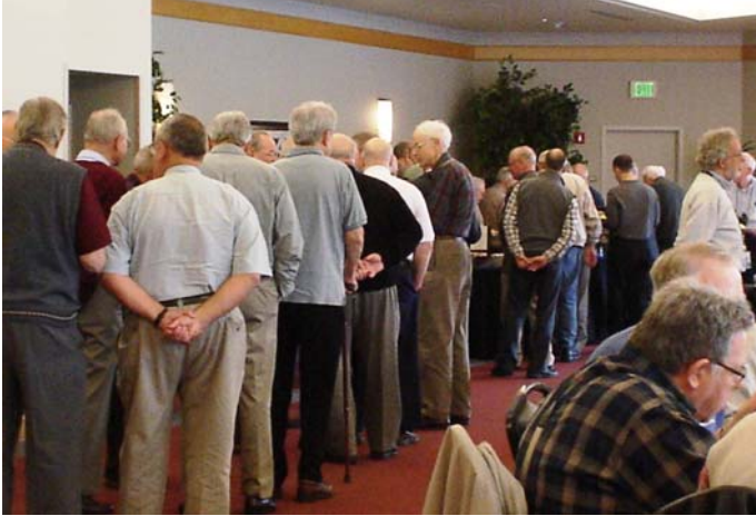
Attendees in line for brunch at the Museum of Flight.